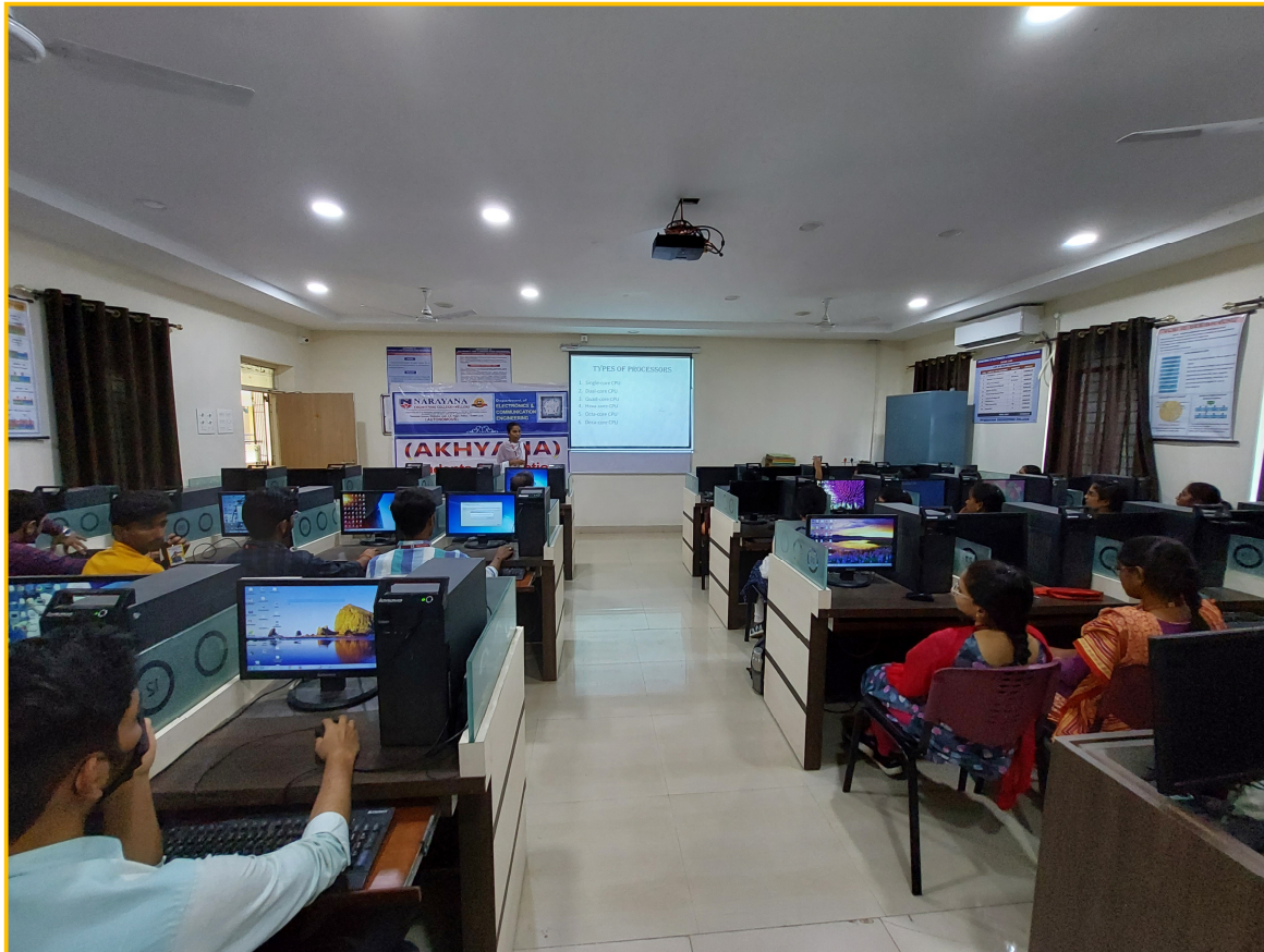
Participants at the event